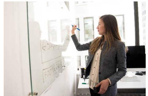
Image 3. Woman Wearing Gray Blazer Writing on Dry-erase Board