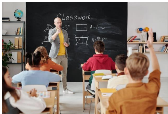
Image 2. Teacher Asking a Question to the Class