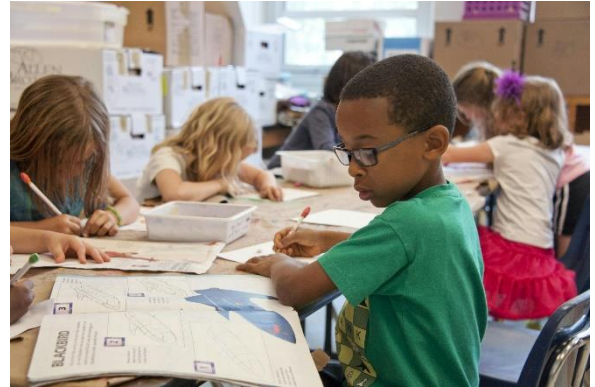
Image 4. Boy In Green Shirt