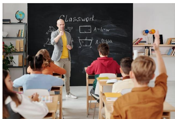
Image 2. Teacher Asking a Question to the Class