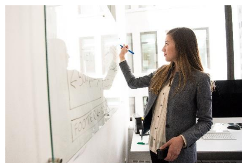
Image 3. Woman Wearing Gray Blazer Writing on Dry-erase Board