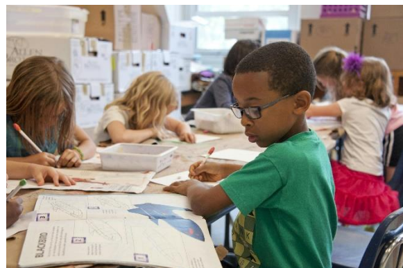
Image 4. Boy In Green Shirt